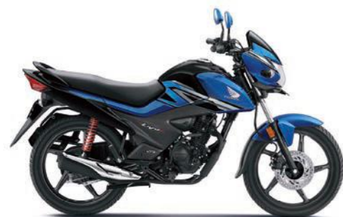
ATHLETIC BLUE METALLIC